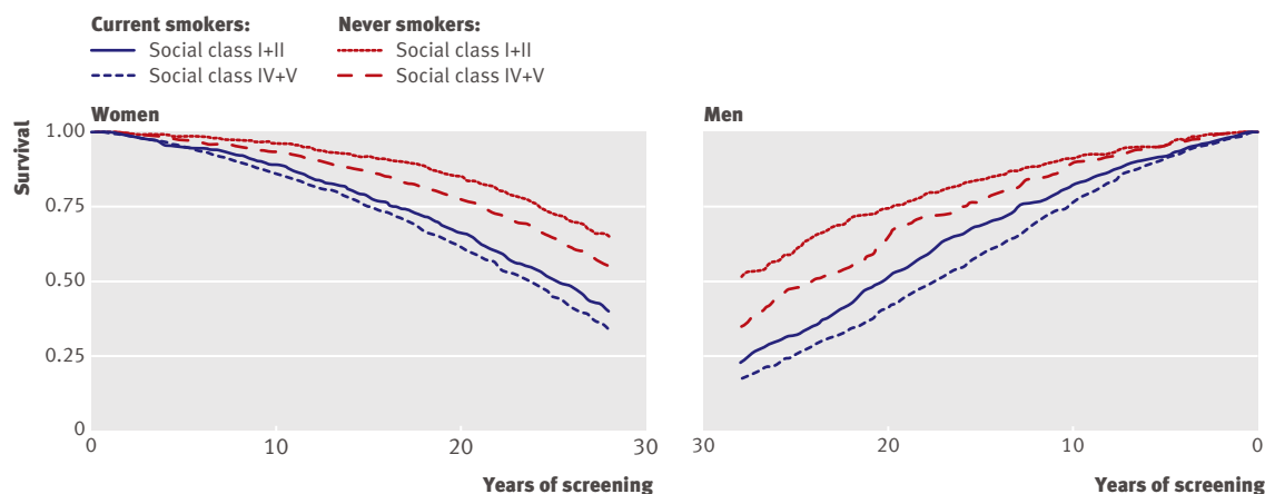
Fig 3 | Age adjusted survival over 28 years of follow-up of women and men aged 45-64 years and who never smoked or currently smoked at recruitment in social classes I + II and IV + V

lowest social classes in our cohort at recruitment. Thus, because all participants who stopped smoking after recruitment to the present study continued to be classified as current smokers, the full impact of continued smoking across the population is very likely to be understated by our results and the differences in survival between smokers in higher and lower social positions exaggerated.